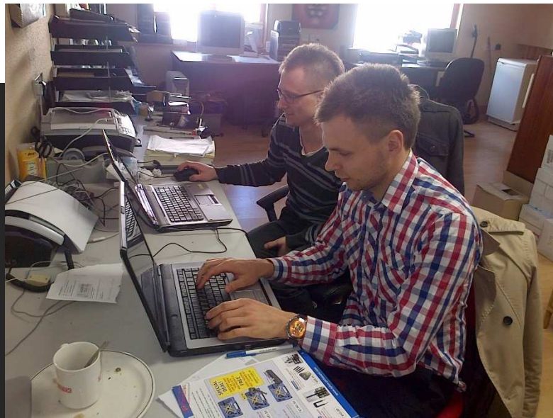
Polish IT students