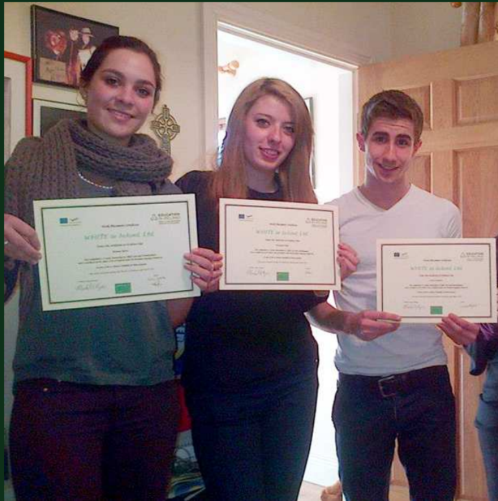
French child development student