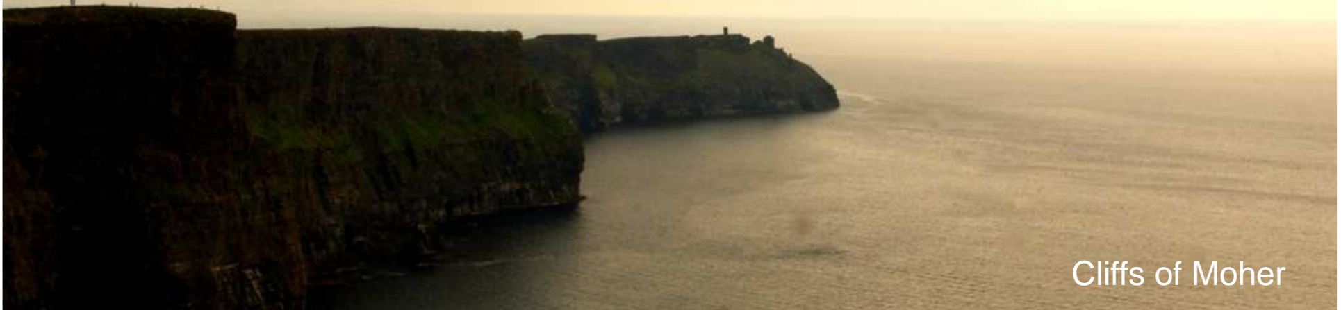
Cliffs of Moher