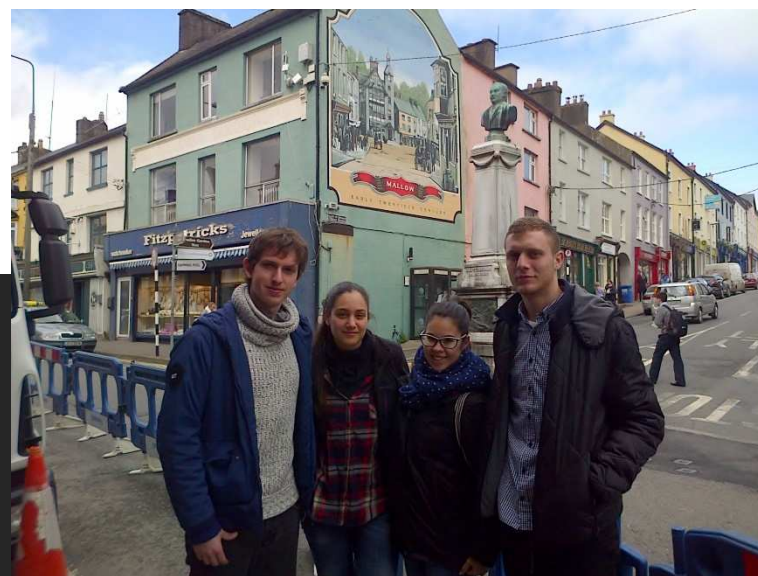
Spanish students explore Mallow