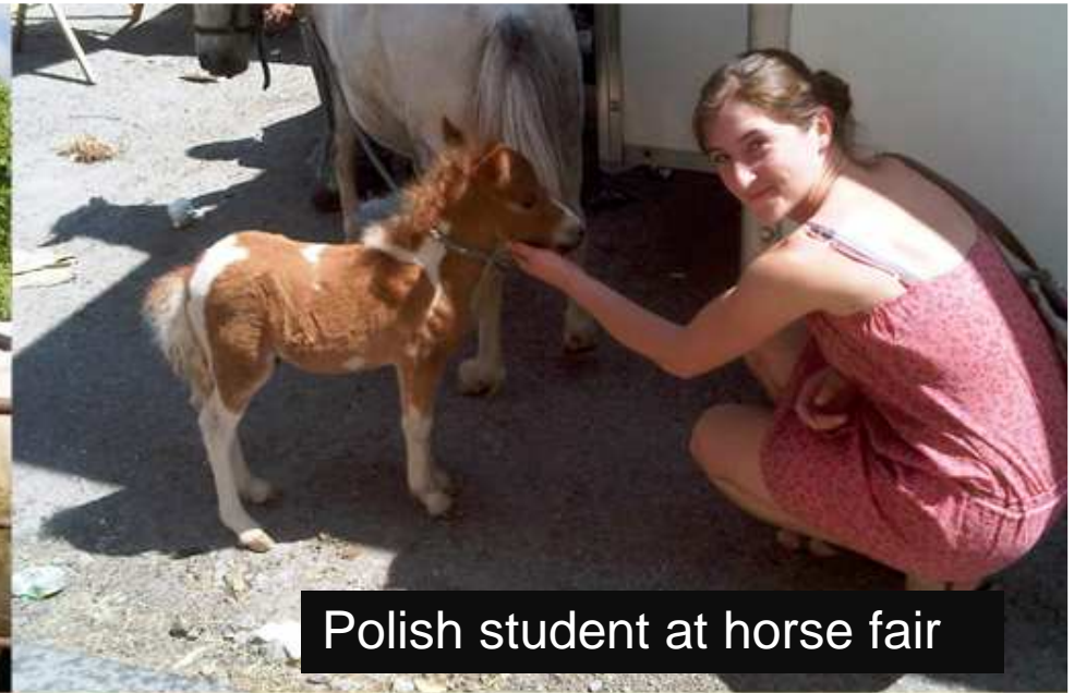
Polish student at horse fair