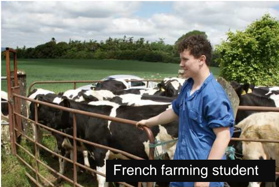
French farming student