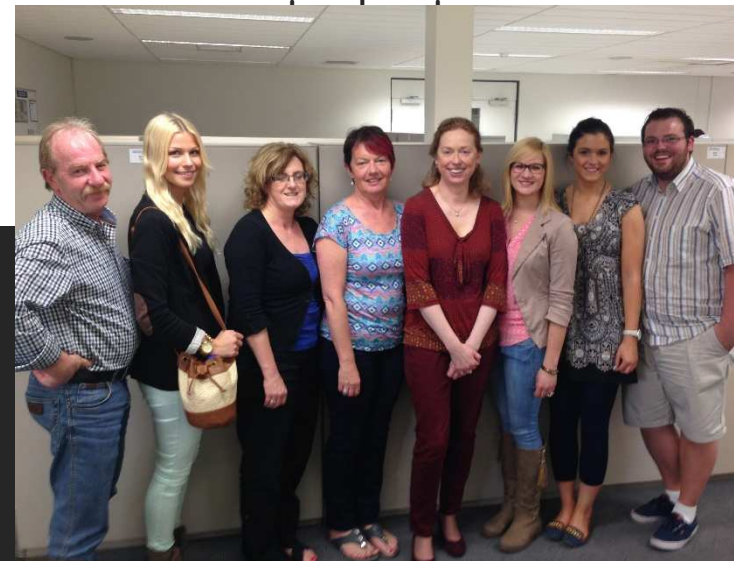
German Business Student