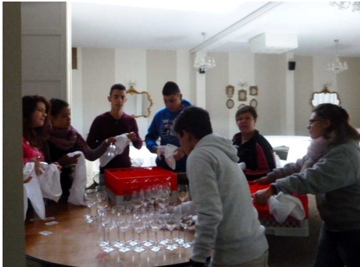
Italian Hotel Students