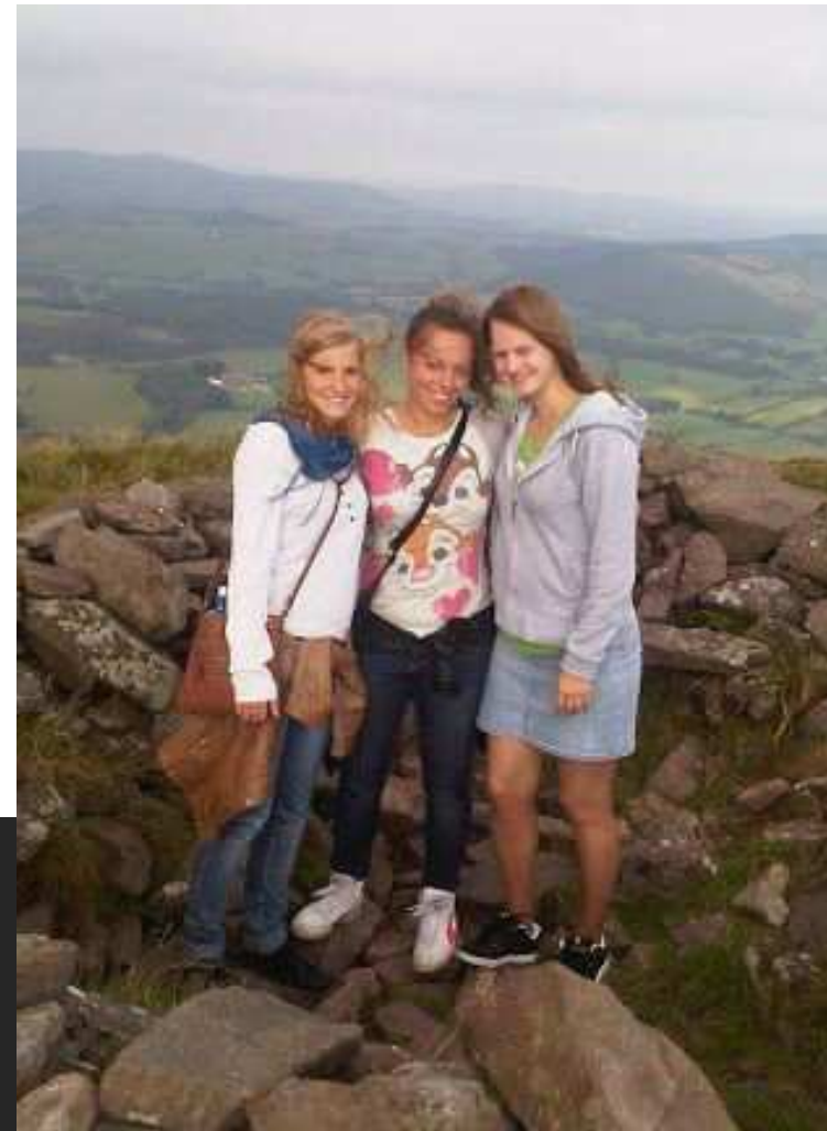
German, Italian and Lithuanian students mountain climbing