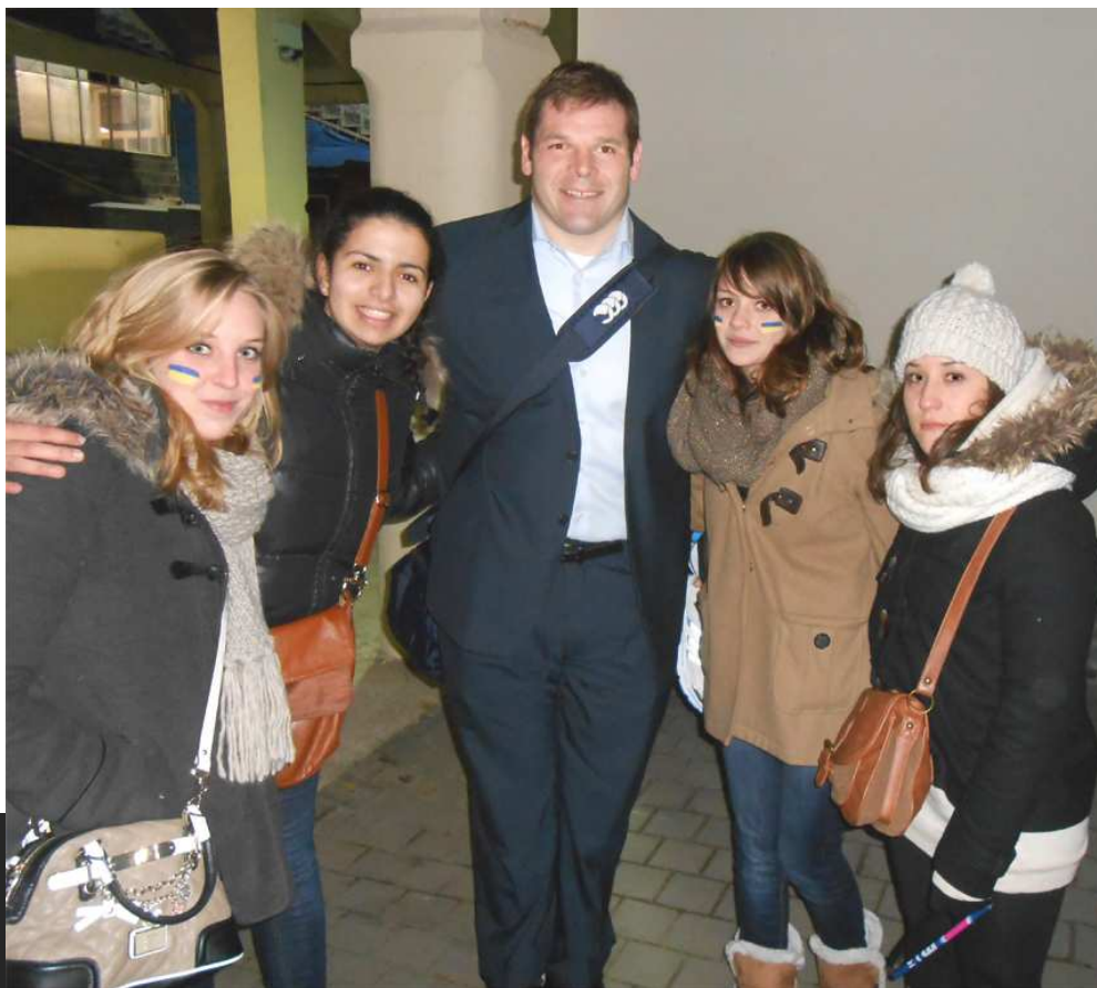
French students meet Irish Rugby star Mike Ross