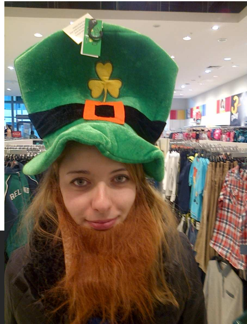
French student on St. Patrick's day