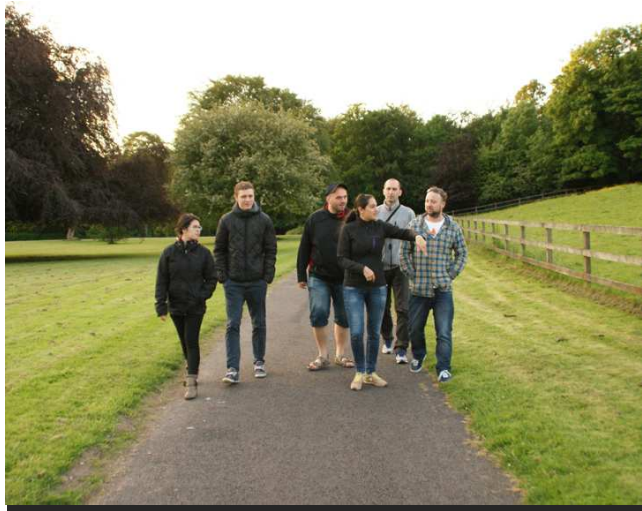
Students in Doneraile Park

We are a short walk from one of Ireland's most beautiful national parks