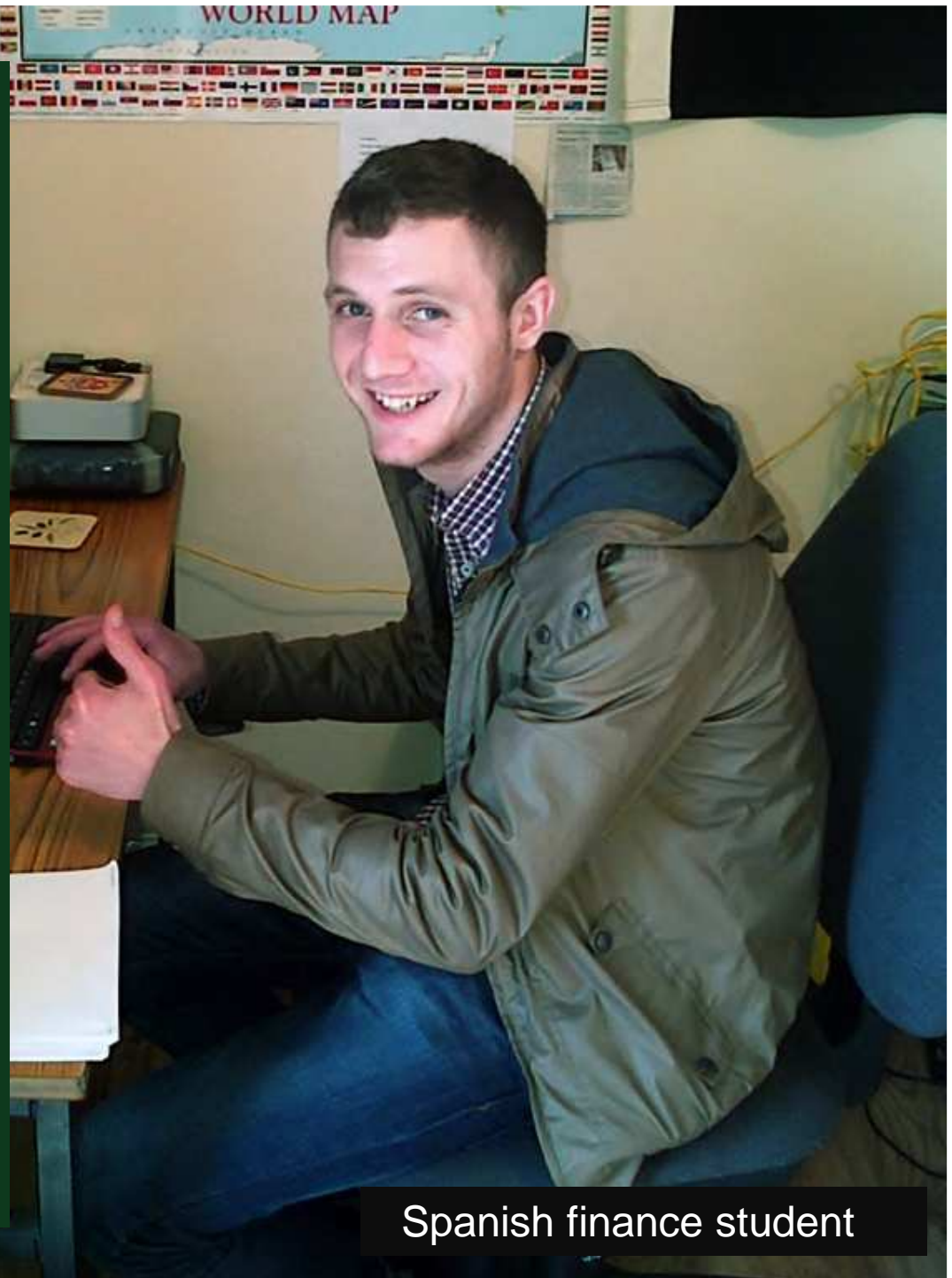
Spanish finance student

○ Be in a significantly better position to find a job or