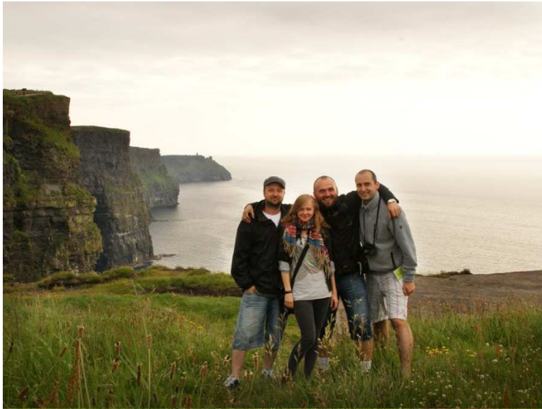
Polish students, Cliffs of Moher