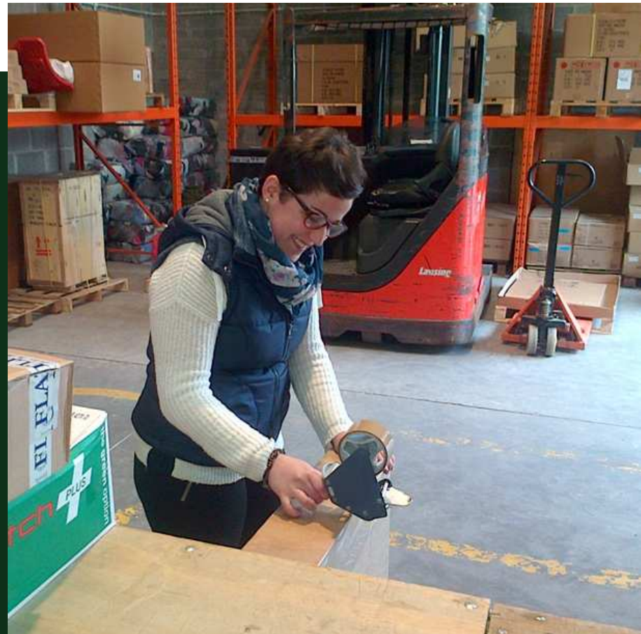
Spanish logistics student