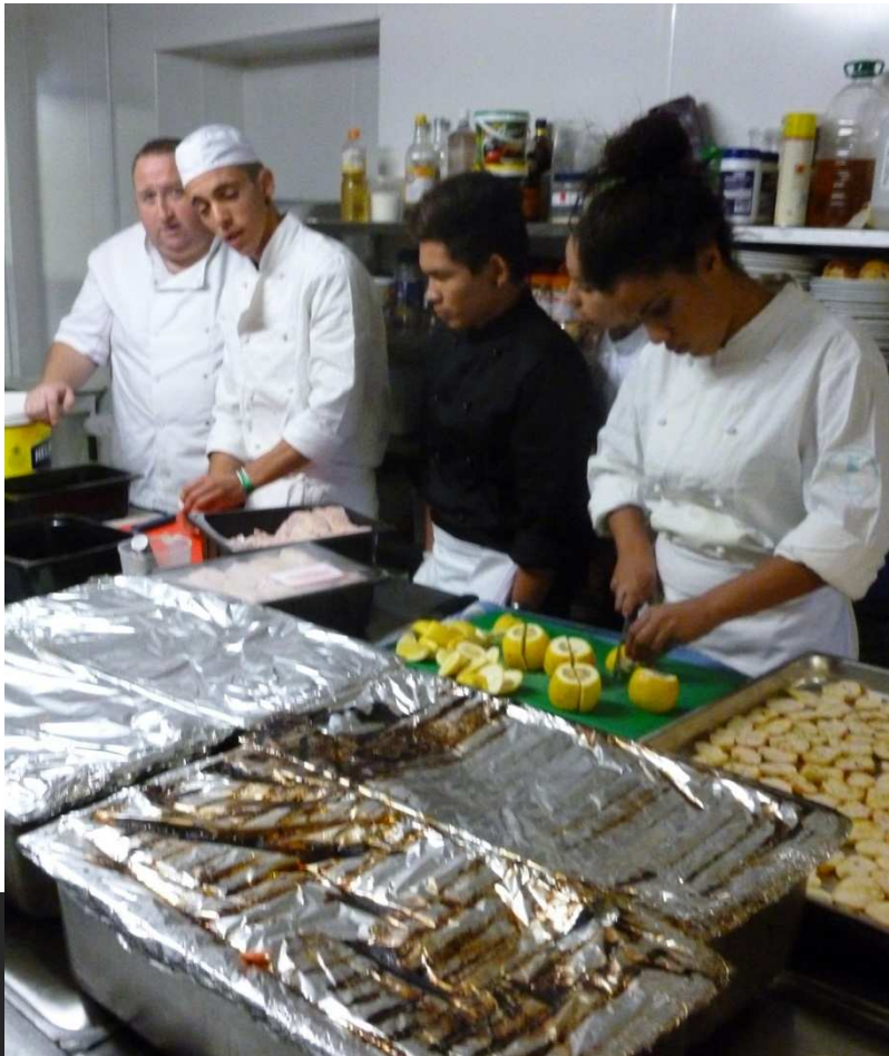
Italian Catering students