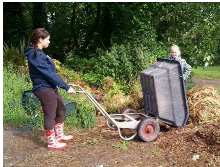
French Equine Students